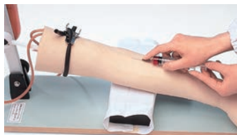
Needle injection has same feel as with a human arm.

A series of techniques such as confirmation of injection site, insertion hypodermic needle and injection of medicine are possible with this model. The pressurized blood vessel can be palpated, and needle insertion provides a feeling similar to that offered by a real human arm. Blood vessel tube is durable enough to be used in numerous practice injections.