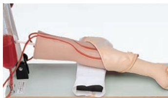
Replaceable outer skin and blood vessel tube.